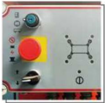
支腿互锁 OUTRIGGER INTERLOCK