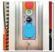
防误操作和平台电源 DEADMAN SWITCH& AC POWER