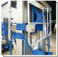
翻转式铝护栏 FOLDING-DOWN GUARDRAILS