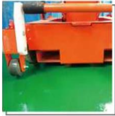
标准叉车孔 FORKLIFT POCKET