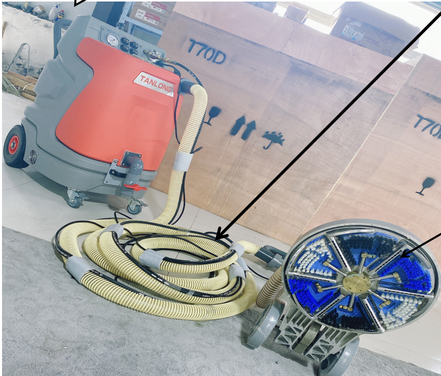
TRE Extractor Package

More information, please contact our distributor nearby your location to ask for more tech and price !